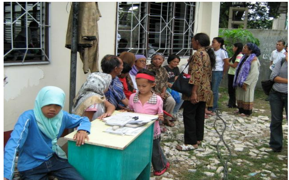
Women and children of Sta. Barbara, Zamboanga City patiently waited to have their free chest x-ray examinations done despite frequent power interruptions.