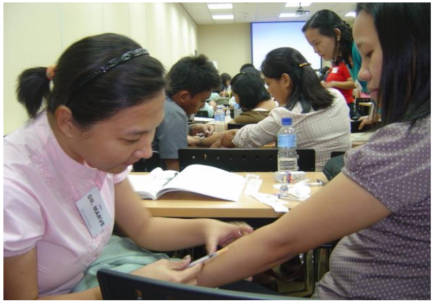
RETURN DEMONSTRATION ON TST. Prospective field staff for the 2007 NTPS underwent a series of procedure demonstration and return demonstration to prepare them for fieldwork.

Marami pong salamat sa inyong pagsali at pagtulong sa pagsisiyasat na ito!