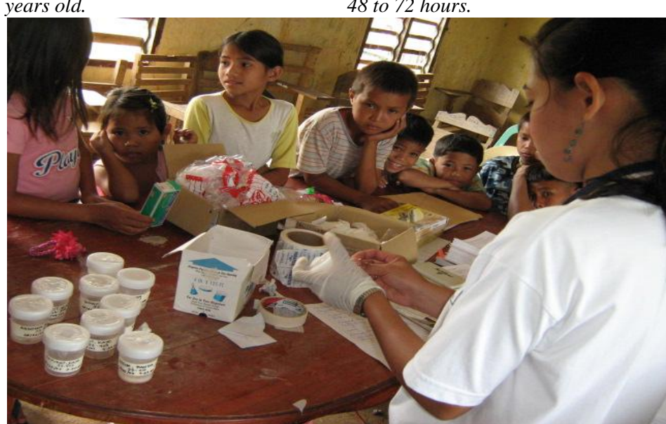
SPUTUM COLLECTION . A laboratory technician sealed and labeled the sputum specimens submitted by residents of Maguing, Lanao Del Sur who had abnormal chest x-ray findings.