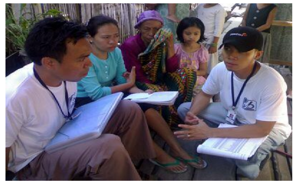
HOUSEHOLD AND INDIVIDUAL INTERVIEWS. Survey teams conducted interviews among household heads and eligible individuals.