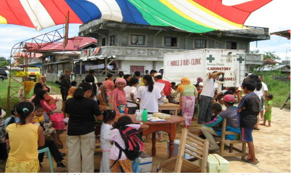
Men, women and children of Brgy. Bato-Bato, Maguing, Lanao Del Sur participated in the cluster assembly activities; free chest x-rays were offered to individuals aged 10 years old and above. An x-ray mobile can be seen at the background.

After criss-crossing the country from four previous cluster areas, Team 1 has never had as grand a reception as that in Maguing, Lanao Del Sur. A big purple banner in the main road greeted the team with a "BIG WELCOME" from the Datus, Bais and officials of this inconspicuous barangay of Bato-Bato upon the team's arrival. To top it all, all of the "bigwigs" from the local government, Municipal Health Office and Philippine National Police were with the team on the first day of the survey, with the residents participating in what was held as the "NTPS Forum Day." Neat! The team never felt so important until Maguing came along. Notwithstanding the foreboding news of military clashes with the local insurgents, the team was provided with police escorts 24/7 during their entire stay. For sure, it was for the team's safety. The team thought it had VIP written all over it. To sum up this experience, in one word, the team found it AWESOME! (Christian Villacorte, Team Leader, Team 1)