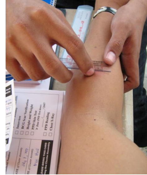
TST READING . Tuberculin skin tests were read by a standard reader after 48 to 72 hours.