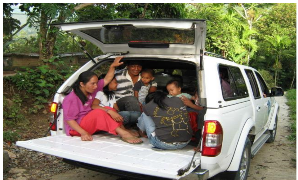
Partners from the Center for Health Development – Cordillera Administrative Region (CHD – CAR) and Japan International Cooperation Agency (JICA) assisted the residents of Asipulo, Ifugao reach the cluster assembly site.